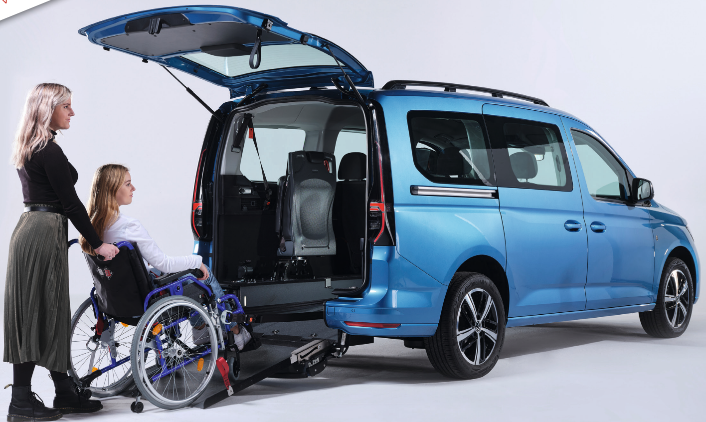
Image shows Volkswagen Caddy Maxi